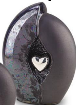
KU 010 M 24cm high