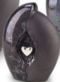
KU 010 S 17cm high