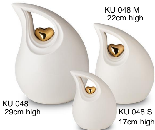
KU 048 M 22cm high